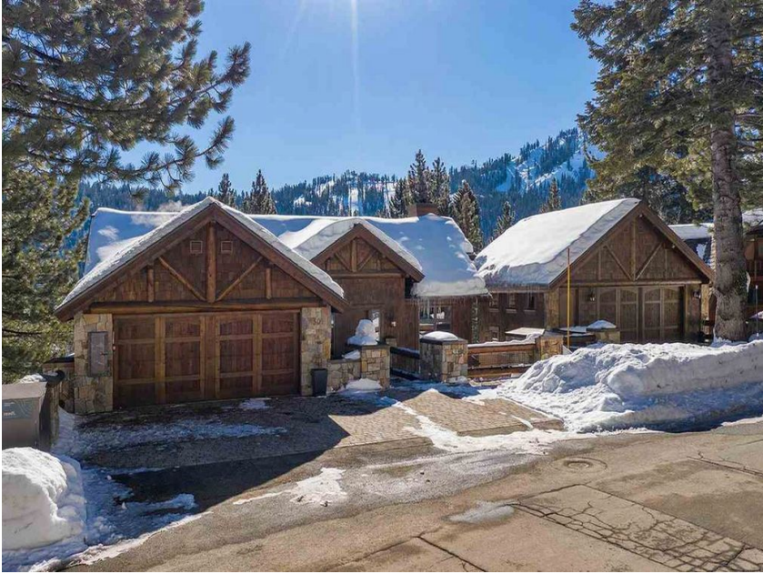
The Broken Arrow Chalet, pre-remodel

We started our journey with the Broken Arrow Chalet with the intention of spending more time with family in our favorite place to ski. When looking for places to stay, it became clear that many of the homes available didn't feel like the luxurious getaway we were looking for--so we decided to create one. The house we purchased needed a lot of love to replace the haphazardly-selected, and dated finishes.