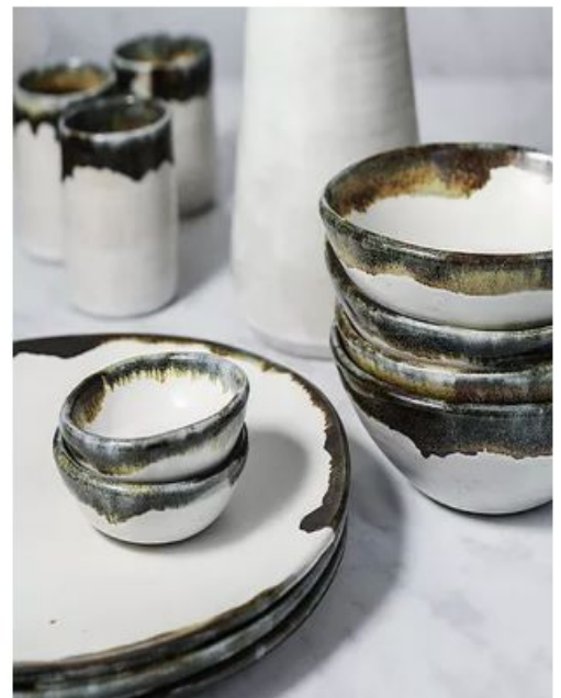
Request MMClay Ceramics to be sent to your home