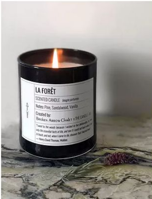
Take home the candle-- we'll add it to your tab $45

Head over to brokenarrowchalet.com to the Shop Our Style section to purchase or request some of the pieces we've curated just for you.