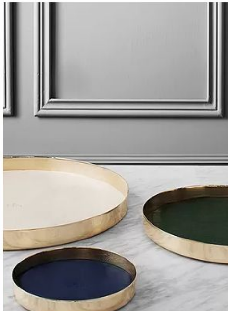
Shop Skultuna Brass