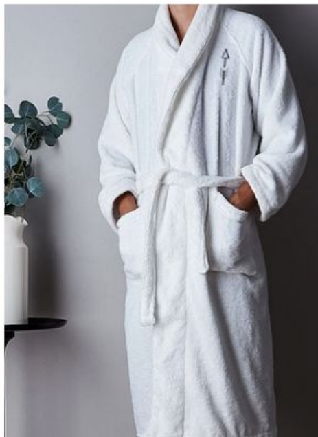
Request a robe to be sent to your home $200