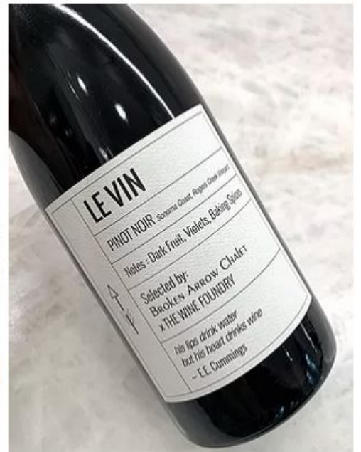
Take home an extra -- we'll add it to your tab $75