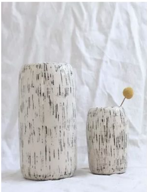
Shop BTW Ceramics