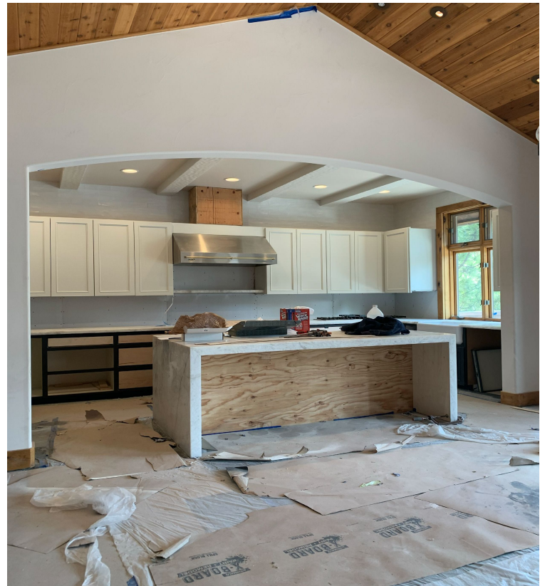
The kitchen, mid-remodel, adding in storage and breakfast bar

We got to work adjusting the floor plan, upgrading surfaces, storage, plumbing and appliances, always keeping in mind the goal to create the most comfortable, relaxing experience possible. We have taken everything we have learned from remodeling our clients' homes, what aspects they love and can't live without, and made sure to include these high-end options in the chalet. Our principal, Holly, has always loved the glamorous ski homes of the past, and the nostalgia they evoke. We included nods to the retro, the elements that made these spaces unforgettable. We hope you enjoy the home, and all of the pieces created by artisans we love. Each piece was selected with you in mind, and we hope you remember this stay for years to come.